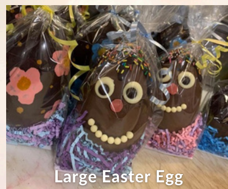
Large Easter Egg

Large Easter Egg: Choice of dark chocolate, milk chocolate or white chocolate, filled with guimauves and small Easter eggs. (230g) $15