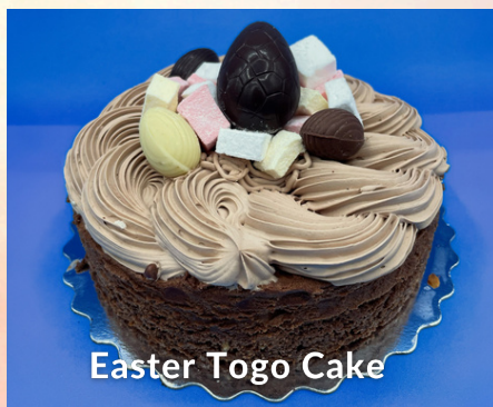
Easter Togo Cake

Easter Togo Cake: 6 servings $39 | 8 servings $50